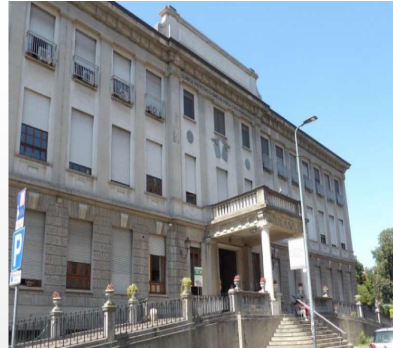
Mangiagalli Clinic, Gynecological Unit, Policlinico Hospital, Milan