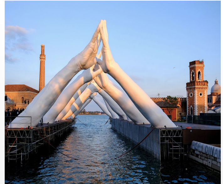
Building bridges, Lorenzo Quinn